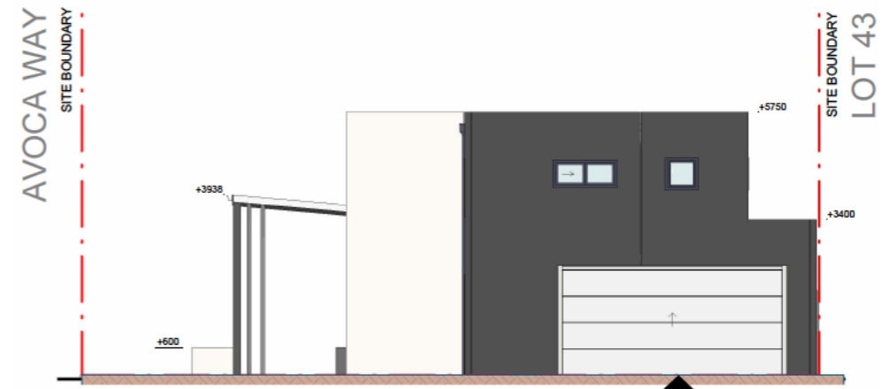
Garage North Elevation